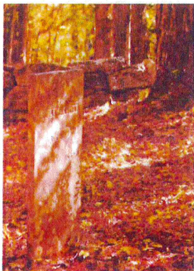
Dudley Leavitt Gravestone

MEREDITH CONSERVATION COMMISSION maintains Page Pond and Forest. This trail map and guide courtesy of the volunteers who serve on the Meredith Conservation Commission.